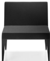
Seat with Back